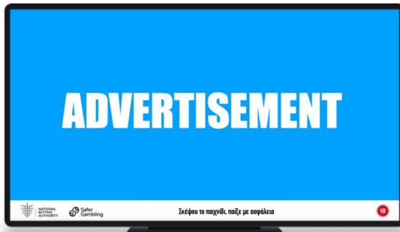
D1: During the first 90% of the advertisement