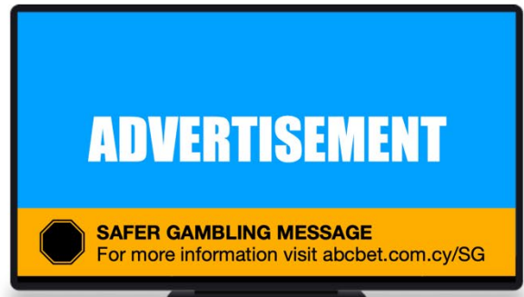
D2: During the last 10% of the advertisement